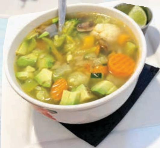
VEGETABLE SOUP $8.99