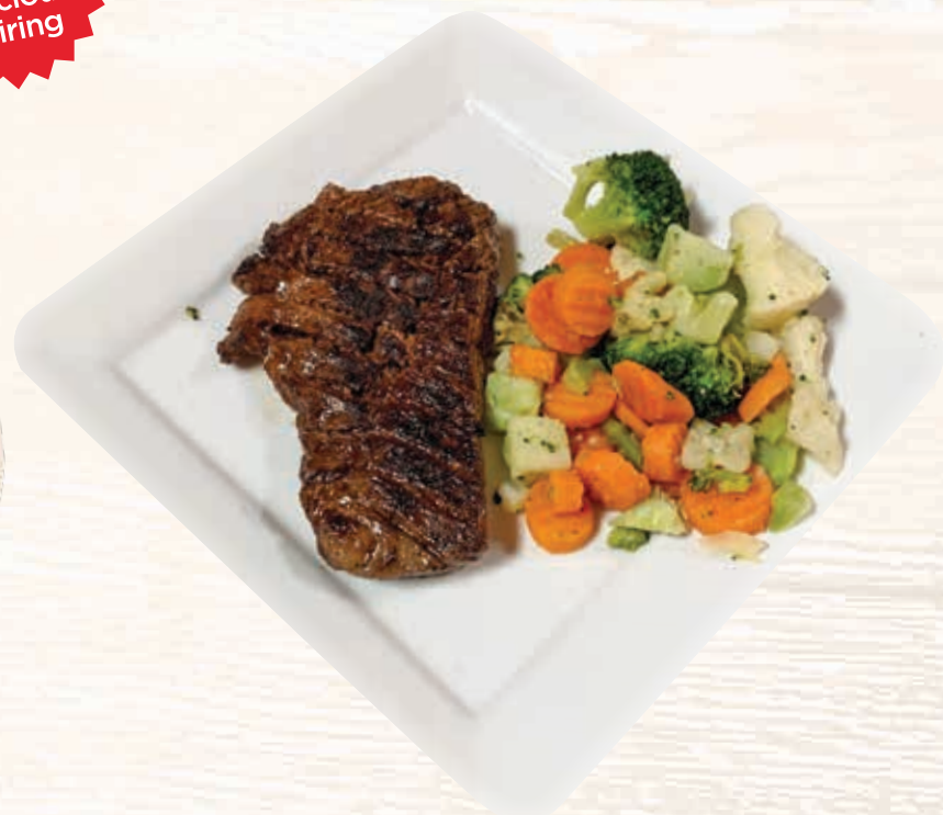
SKIRT STEAK WITH VEGETABLES $19.99