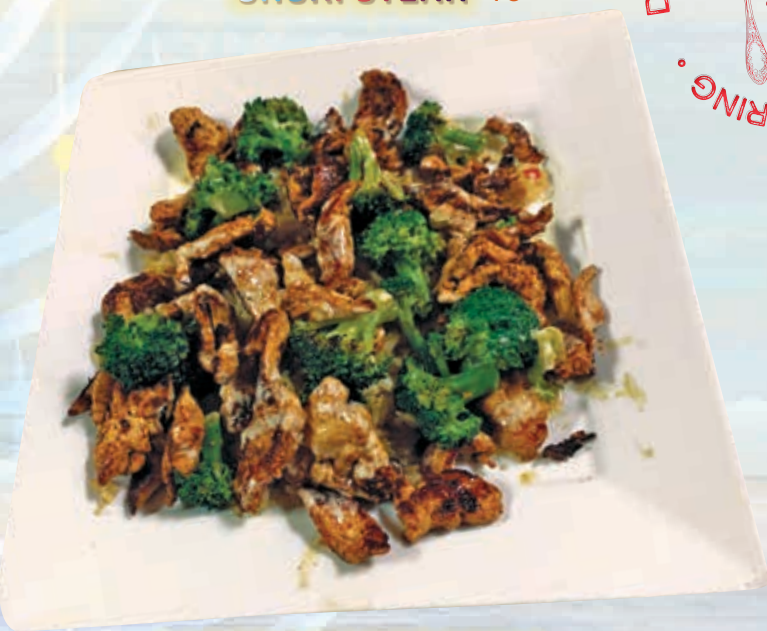
ARROZ CON BROCCOLI $14.99