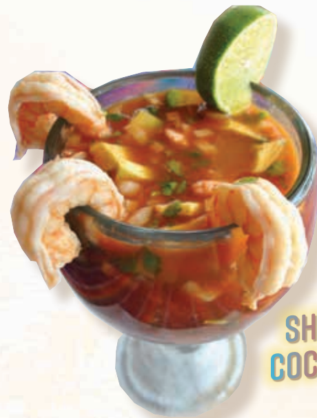
SHRIMP COCKTAIL* $16.49

Burrito, enchilada, taco & chalupa. Served with rice & beans, topped with chile relleno $16.99