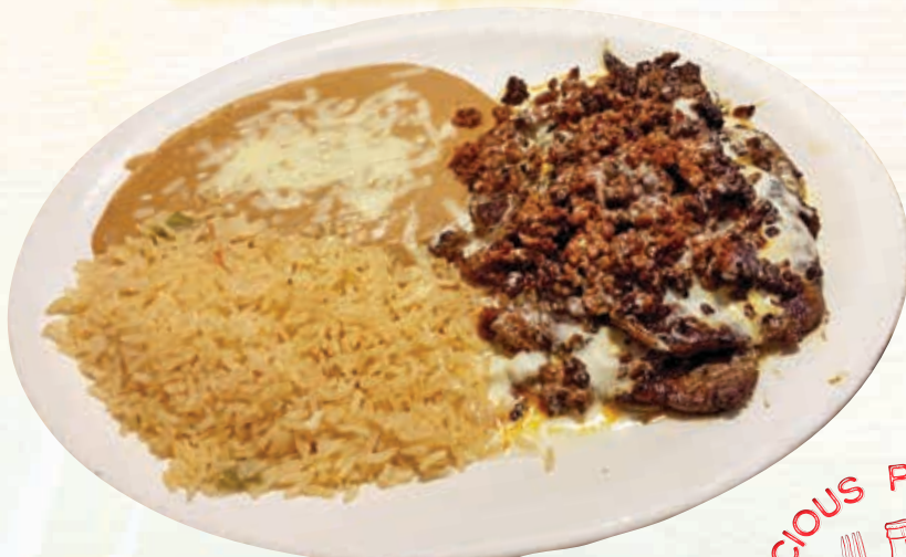
CHORI STEAK $16.99