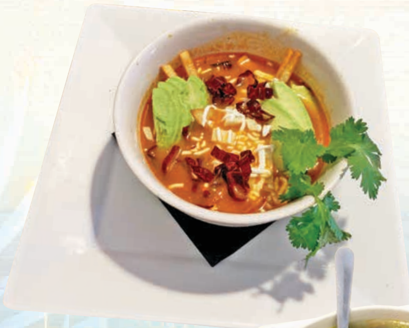
TORTILLA SOUP $8.99