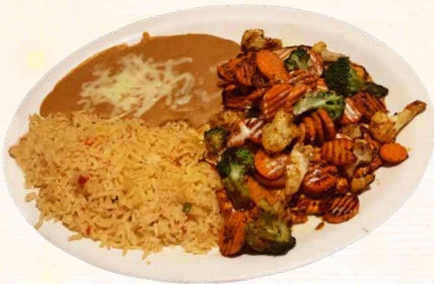
POLLO TAPATIO $15.99