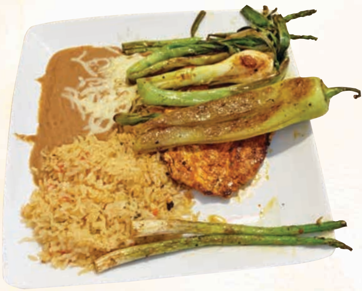
LUNCH POLLO A LA PARRILLA $9.99