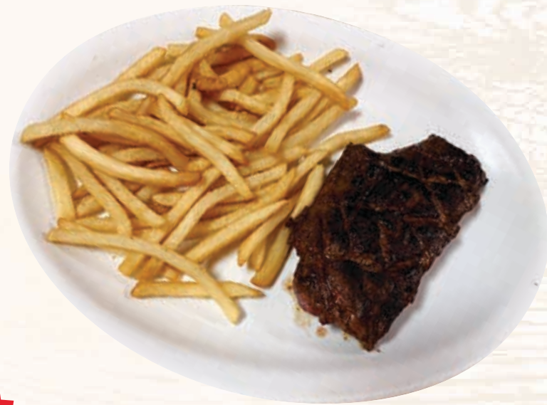
STEAK AMERICANO $18.99