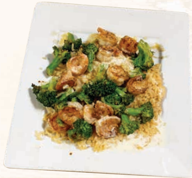
ARROZ CON BROCCOLI WITH SHRIMP $15.99