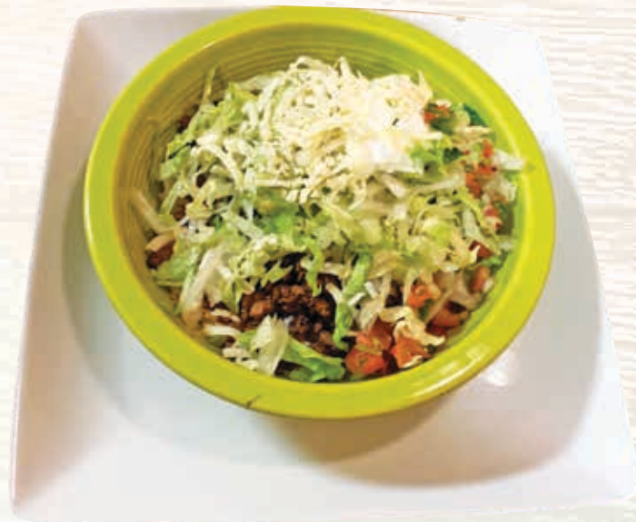
BURRITO BOWL $8.99