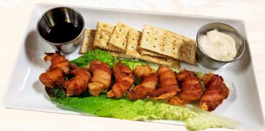
APPETIZERS CAMARONES SINALOA $9.25