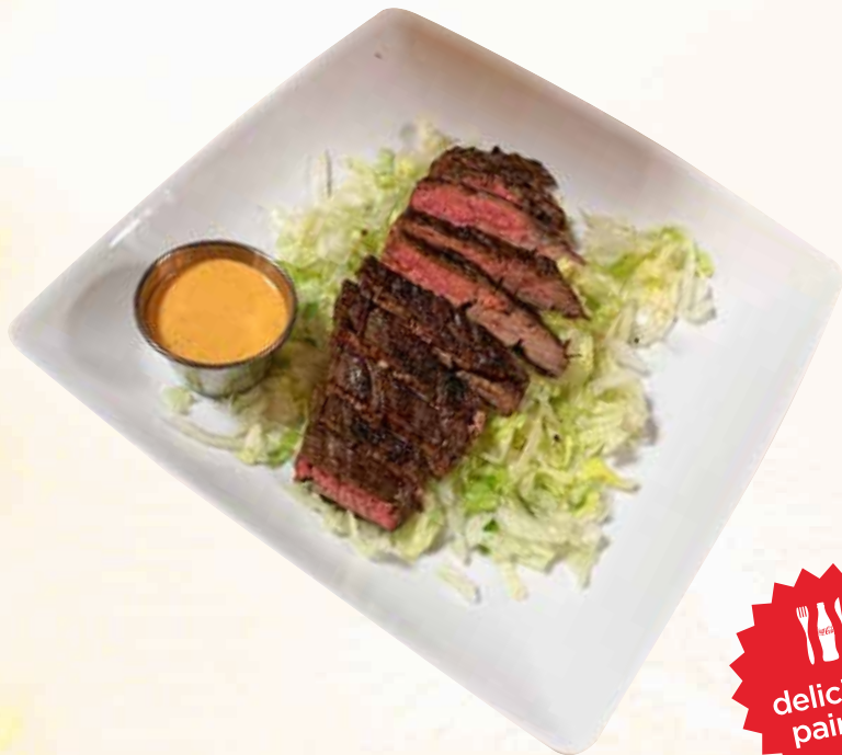
SKIRT STEAK APPETIZERS $13.99