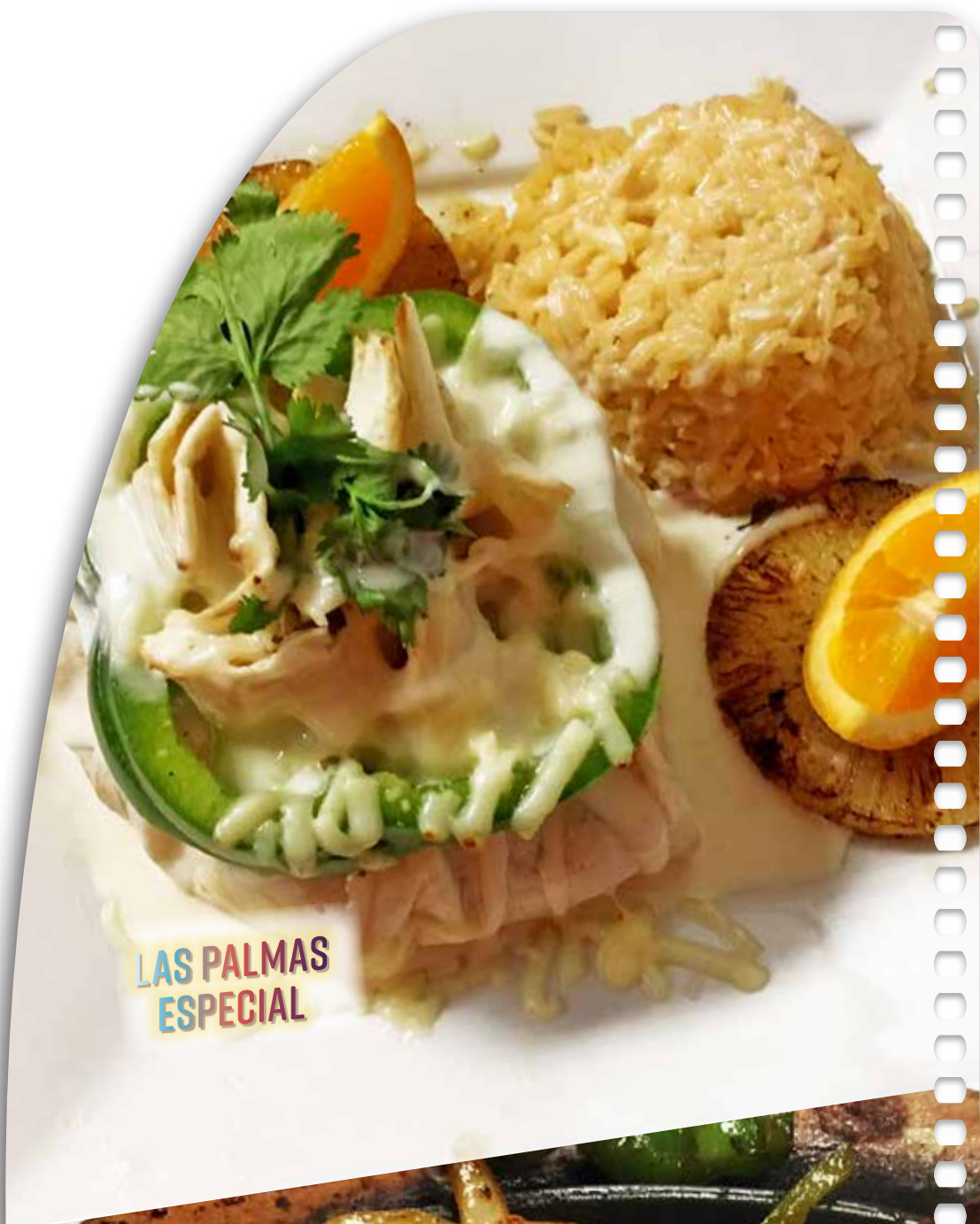
LAS PALMAS ESPECIAL