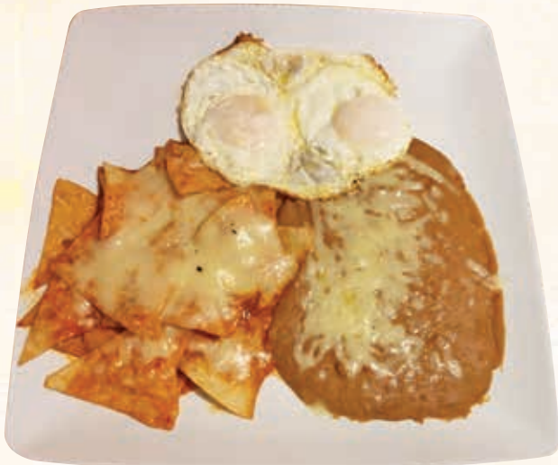
LUNCH CHILAQUILES $8.99