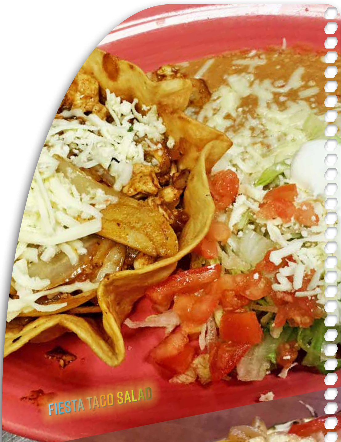
FIESTA TACO SALAD