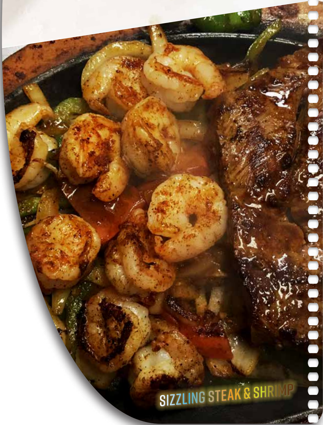
SIZZLING STEAK & SHRIMP