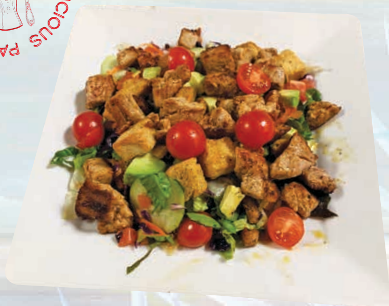
CANCÚN SALAD $16.99