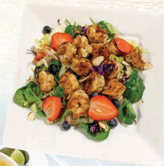
VALLARTA SALAD $13.99